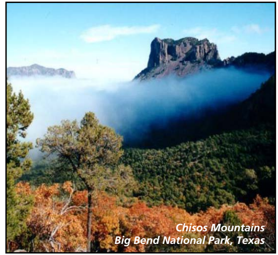
Chisos Mountains Big Bend National Park, Texas